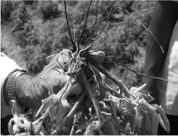
Fig. 3. Root-rot and wilt of C. forskohlii

individual plants. Severely infested seedlings produce few roots and usually die rapidly. Heavy infection of older plants causes the plant to wilt unexpectedly and die off early. Swelling or galls develop on the roots of the infected plant, as the result of nematode induced expansion of root cells. The galls vary in size from slight thickenings to lumps 5 to 10 cm across. All root knot galls damage the vascular tissues of roots and thus interfere with normal movement of water and nutrients. They also increase the susceptibility of the root system to invasion by disease causing fungi and bacteria. Root knot disease in C. forskohlii has been reported to be caused by Meloidogyne incognita and Meloidogyne arenaria . Meloidogyne incognita has been reported to cause a yield reduction of upto 86% (Senthamarai et al. , 2006), while severe losses also occur in C. forskohlii because of Meloidogyne arenaria infestations (Bhandari et al. , 2007).