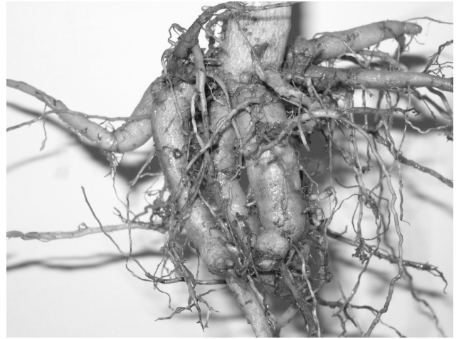
Fig. 4. Root-knot disease of C. forskohlii

Water stagnation in C. forskohlii fields may lead to severe infections of Fusarium and Ralstonia , therefore water stagnation in the planted fields should be avoided.