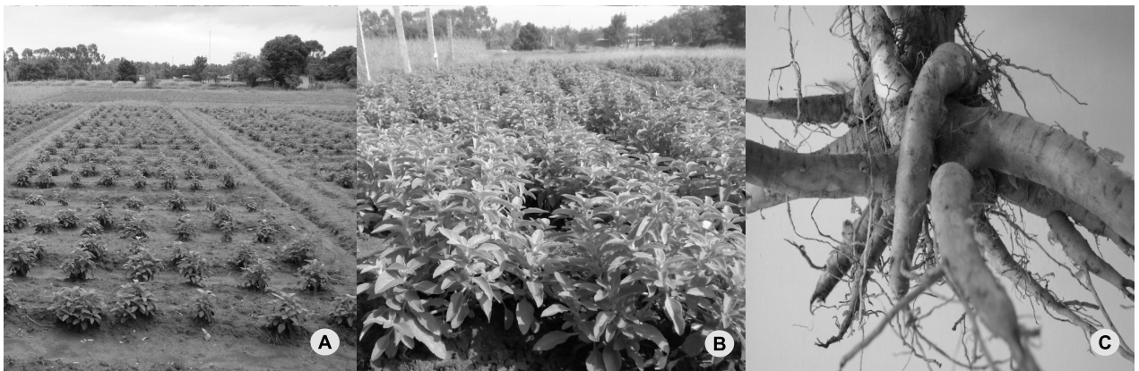
Fig. 2. (A,B) Cultivation of C. forskohlii ; (C) Healthy root